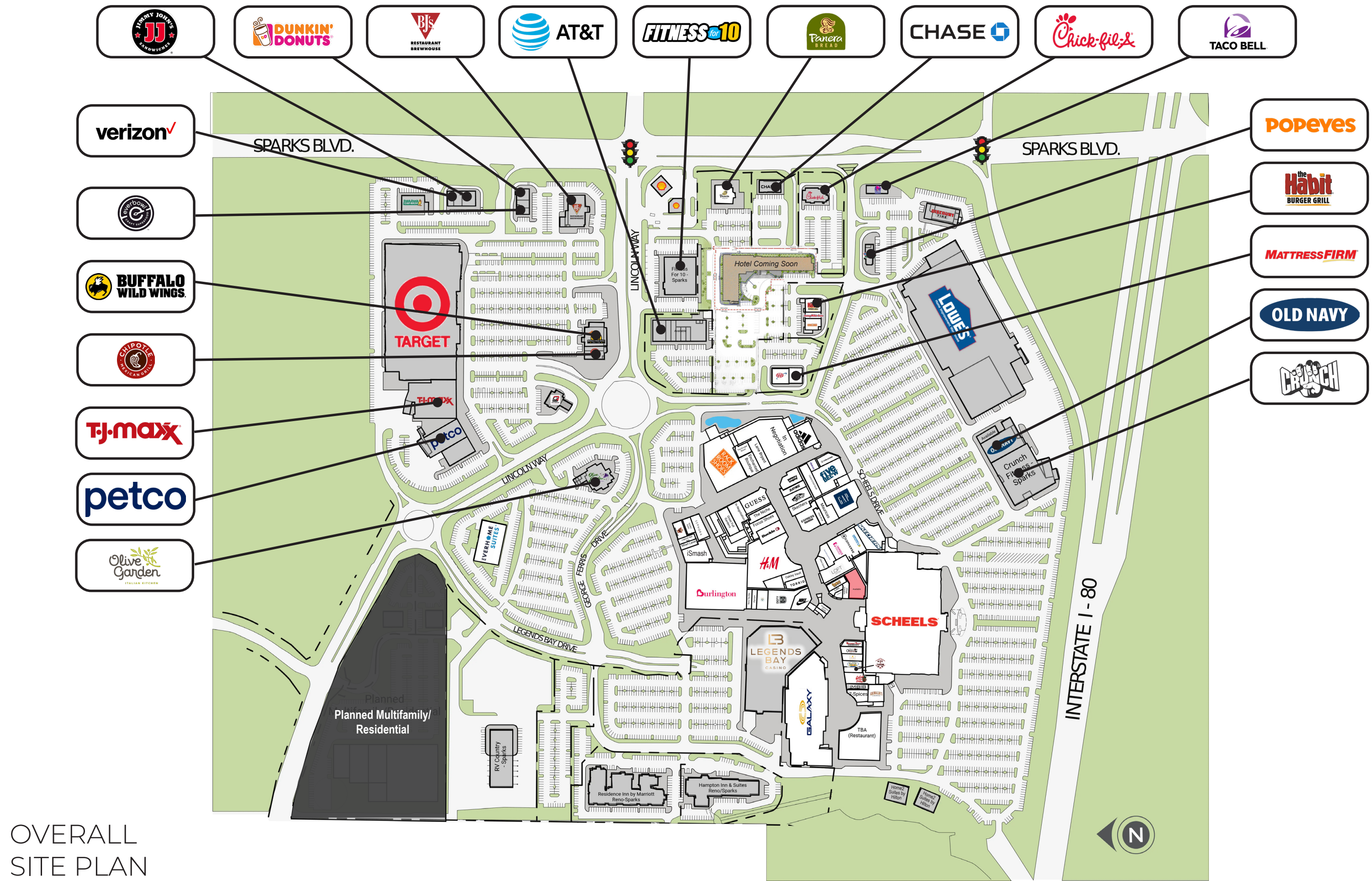
OVERALL SITE PLAN